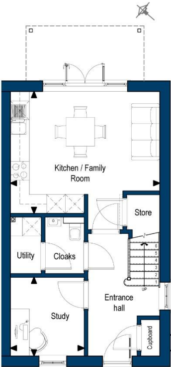
GROUND FLOOR Kitchen / Family Room 4.75m x 3.87m (15'7" x 12'8") Study 2.5m x 2.35m (8'2" x 7'8")