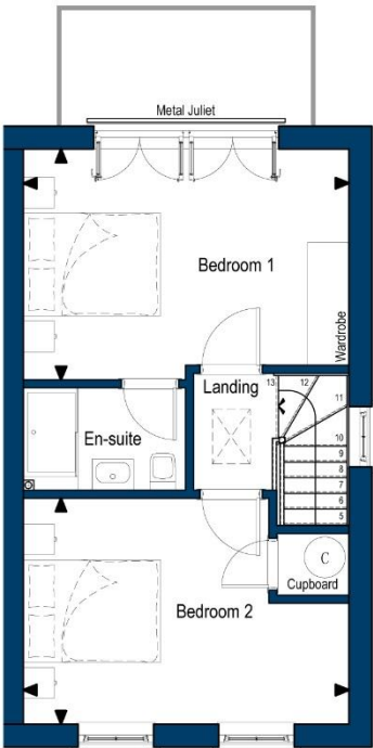
SECOND FLOOR Bedroom 1 4.75m x 3.37m (15'7" x 11'1") Bedroom 2 4.75m x 3.3m (15'7" x 10'10")