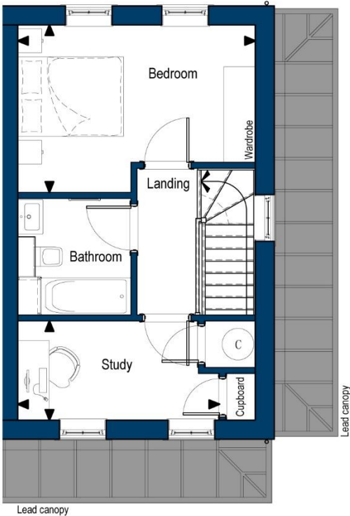
FIRST FLOOR Bedroom 4.50m x 3.16m (14'10" x 10'5") Study 3.81m x 1.87m (12'6" x 6'1")