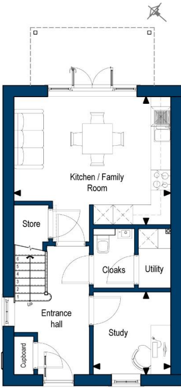
GROUND FLOOR Kitchen / Family Room 4.75m x 3.87m (15'7" x 12'8")