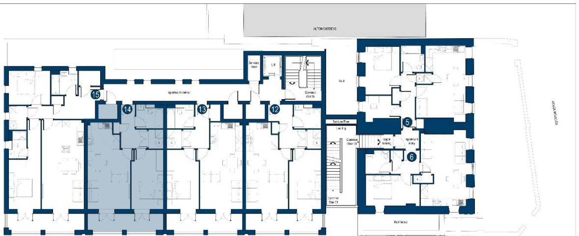
SECOND FLOOR PLAN - APARTMENT 14

Bedroom 13.2sqm (142.1sqft) 5.00m x 2.70m (16'5" x 8'11")